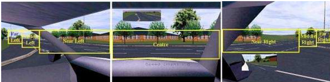
Figure 1: Categorisation of visual scene into 'areas of interest' defined by distance from driver position.

A SensorMotoric Instruments (SMI) head mounted eye tracking system was used to collect data relating to gaze and these data were stored in MPEG format. Analysis was conducted using Observer 3.0. The simulation environment comprised a fixed based driver assessment rig and a simulated junction scenario. The visual scene was divided into seven areas of interest (AOI) as shown in Figure 1. 'Far' AOIs represent distances of more than 60m from the driving position, 'middle' AOIs 20-60m, 'near' AOIs less than 20m and the 'centre' AOI within 10m. The scenario started with a convoy of eight cars passing the junction from both directions followed by a series of negotiable gaps that increased in 1.5s increments. A predefined finished point was identified in the straight section of the road following the right turn manoeuvre.